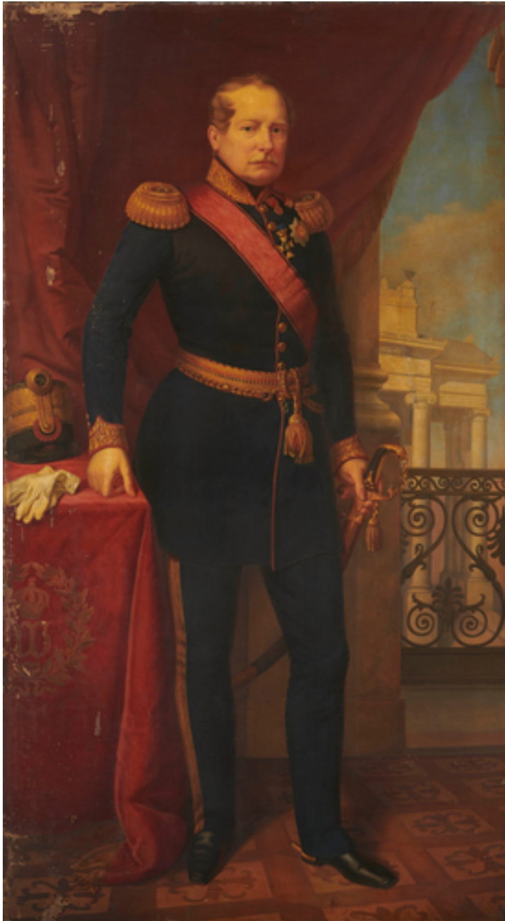
Depicts: Wilhelm I of Württemberg